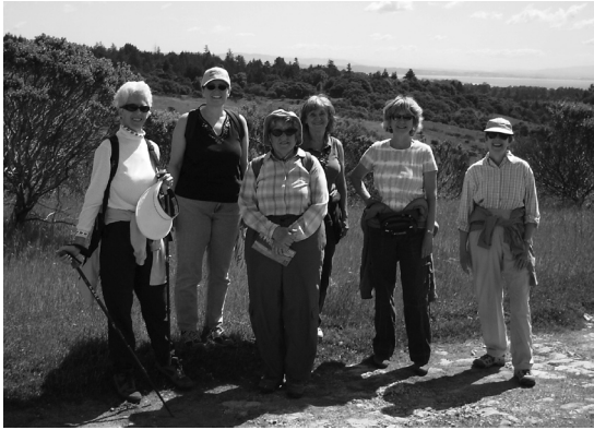
Members of the Hiking Group get a view of Monterey Bay from Wilder Ranch trails.

the past year, our destinations varied from a walk around the Santa Cruz Small Craft Harbor to a more strenuous hike at Mt. Madonna County Park after which we rewarded ourselves with a pie stop at the Gizdich Ranch. Other destinations included Fall Creek State Park, Wilder Ranch State Park (2 routes) and a loop through Pogonip and the UCSC meadow. The farthest we traveled was to Monterey to walk along the coastline toward Pacific Grove. Afterward, we stayed for lunch at Lover's Point.