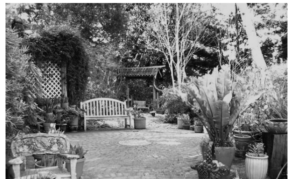
The Garden Club visits Barbara Shield's spring garden