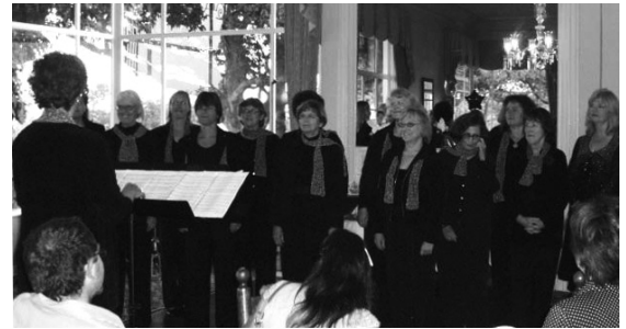
Fiat Musica performs for the Soroptomist Club at Hollins House in June.

Meets Thursdays, 6:30 – 8:30 pm in West Santa Cruz