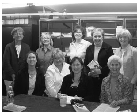
Brown Bag Bibliophiles meet with author Cristina Garcia (center) at the Capitola Book Cafe.

BOOK CLUB 3 (BROWN BAG BIBLIOPHILES) was very lucky to meet the author Cristina Garcia in April to discuss her books A Handbook to Luck and The Aguero Sisters . She was