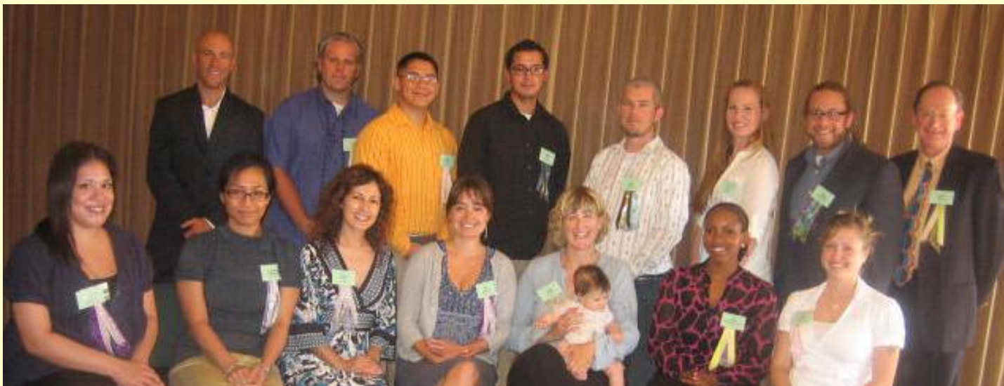
Fifteen of the twenty-three scholarship winners (plus one future scholar!). More details about our students can be found on page 3.

Thanks to the program organizers who made this annual event a success, and to Fiat Musica, who performed yet another superb slate of melodic selections.