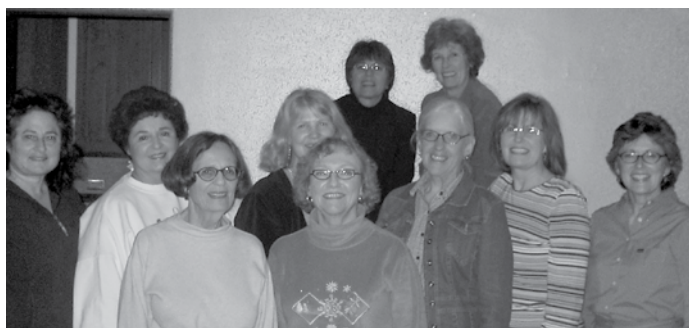
Fiat Musica rehearses for their Peachwood's Performance

For up-to-date Club information, please visit our web site, http://womensclub.ucsc.edu