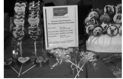
Seventeen vendors including ShutterBug Chocolates display unusual chocolate treats at the first UCSC Women's Club Chocolate Festival in February.