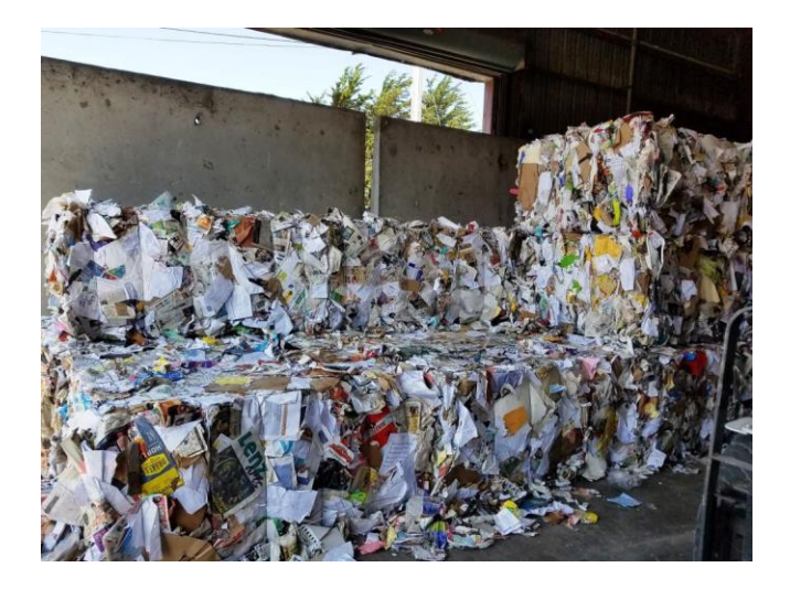
Second photo: Bales of paper ready to be shipped out. Every ton of paper recycled saves more than 3.3 cubic yards of landfill space.